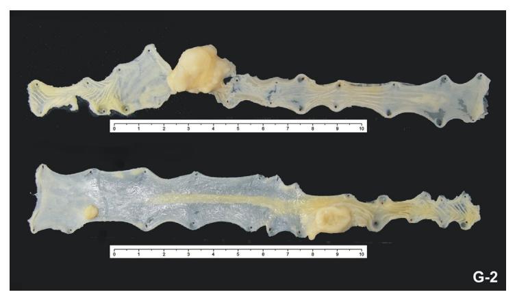
Figure 2. Topographic view of macroscopic growths by G2 – Induced with DMH. Sivieri et al [123]

days of the experiment, to determine the viable cell counts of total aerobic and anaerobic bacteria, Enterococcus spp., Enterobacteria, Lactobacillus spp., Clostridium spp., Bacteroides spp. and Bifidobacterium spp.