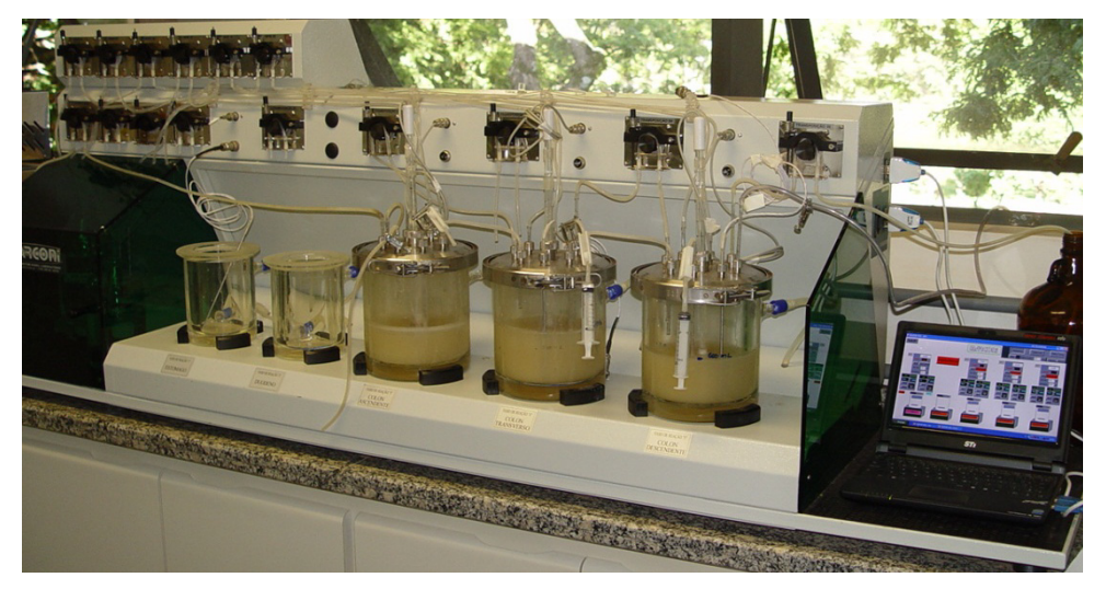
Figure 1. Computer controlled simulation of human microbial ecosystem (SHIME ®) housed in the Probiotics Research Laboratory of FCF/UNESP-Brazil. Sivieri et al.[53]

A major advance for in vitro fermentation systems was the development of continuous multi-stage models, which allow the simulation of horizontal processes. This type of system makes it easy to study the nutritional and physicochemical properties of intestinal microbiota, through the combination of three reactors connected in series, simulating the proximal, distal and transversal colon (see Figure 1). Later, Molly et al. [44] developed the human microbial ecosystem simulator (SHIME ®), which consists of a succession of five connected reactors, which represent the different parts of the human gastrointestinal tract with their respective values of pH, residence time and volumetric capacity (Figure 1). The five reactors are continually agitated and kept at a temperature of 37 °C by means of a thermostat. The medium is kept in the anaerobic state, by daily injection of N2. The appropriate pH for each portion of the GI tract is controlled automatically by adding 1N NaOH or concentrated HCl [44, 45].