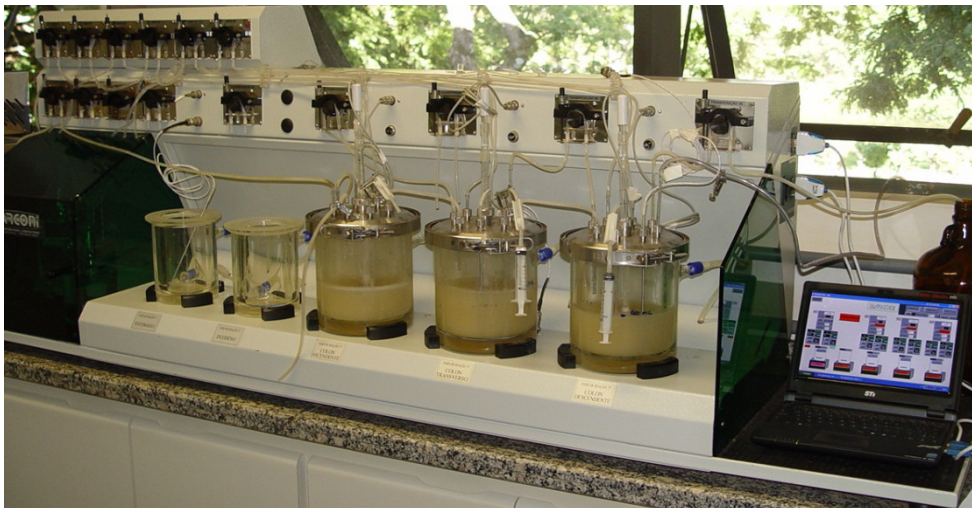
Figure 1. Computer controlled simulation of human microbial ecosystem (SHIME®) housed in the Probiotics Research Laboratory of FCF/UNESP-Brazil. Sivieri et al.[53]

A major advance for in vitro fermentation systems was the development of continuous multi-stage models, which allow the simulation of horizontal processes. This type of system makes it easy to study the nutritional and physicochemical properties of intestinal microbiota, through the combination of three reactors connected in series, simulating the proximal, distal and transversal colon (see Figure 1). Later, Molly et al. [44] developed the human microbial ecosystem simulator (SHIME®), which consists of a succession of five connected reactors, which represent the different parts of the human gastrointestinal tract with their respective values of pH, residence time and volumetric capacity (Figure 1). The five reactors are continually agitated and kept at a temperature of 37 °C by means of a thermostat. The medium is kept in the anaerobic state, by daily injection of N 2 . The appropriate pH for each portion of the GI tract is controlled automatically by adding 1N NaOH or concentrated HCl [44, 45].